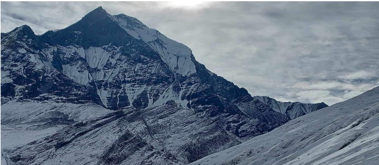
Nearby View During the trek